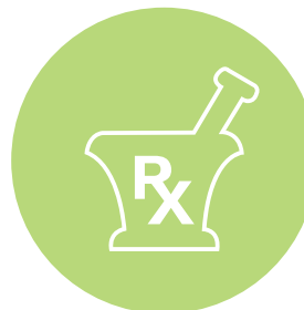
Pharmacy Service Provided by